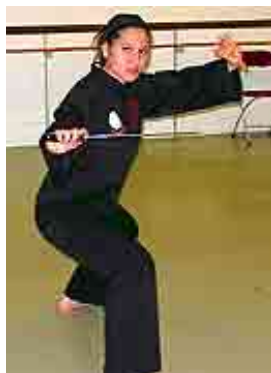
A member of the PSF UK team in action

The International Pencak Silat Federation has developed this martial art into sports ('tanding') and artistic ('seni') competition events, which are included in the South East Asia Games. At the moment Silat is not included in the Olympic Games, but has won recognition in the Asian Games. While the sport side is very combative, the artistic side is beautifully choreographed and as difficult as any specialised dance form.