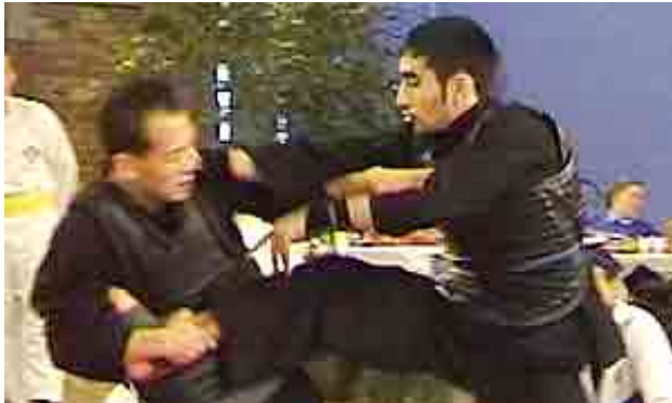
The 'tanding' or sporting version of Pencak Silat

Pencak Silat is a traditional martial art from the Indonesian-Malay Archipelago. This month, London hosts the first ever UK International Pencak Silat Championships - a great opportunity to check it out.